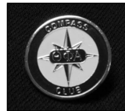
Compass Club Pin

Membership recognizing Alumnae of Theta Phi Alpha who have attended five or more National Conventions