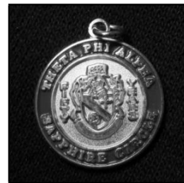
Sapphire Circle Pendant

Membership recognizing Alumnae who have been initiated members of Theta Phi Alpha for more than fifty years