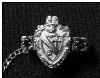
Grand Council Guard

Worn by former members of the Grand Council; a guard pin of the Fraternity coat of arms with a sapphire on each side