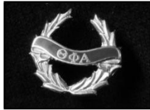
Chapter Charter Member Pin

A document held by the Chapter or Alumnae Association that grants it permission to exist as a component of the national organization