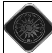
Theta Phi Alpha New Member Pin

A badge of recognition given to each New Member