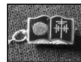
Senior Service Award Guard

An award bestowed upon a graduating senior of a Chapter; a guard pin depicting an open book, black enameled, with a Tudor rose on the left half, and a double cross-crosslet on the right half