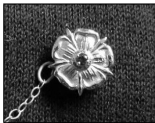
Guard of Honor Pin

The highest award Theta Phi Alpha can bestow upon a member; a guard pin of a gold Tudor rose with a sapphire center