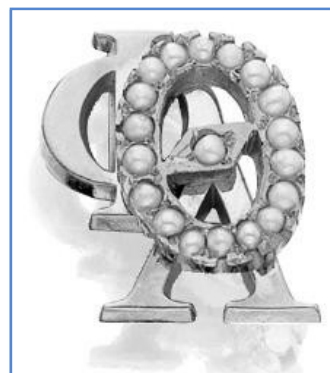
Theta Phi Alpha Badge

A pin that symbolizes membership in a fraternity or sorority